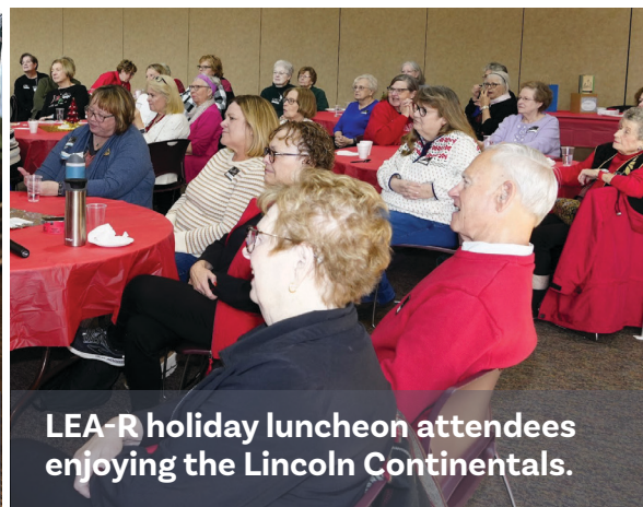
LEA-R holiday luncheon attendees enjoying the Lincoln Continentals.