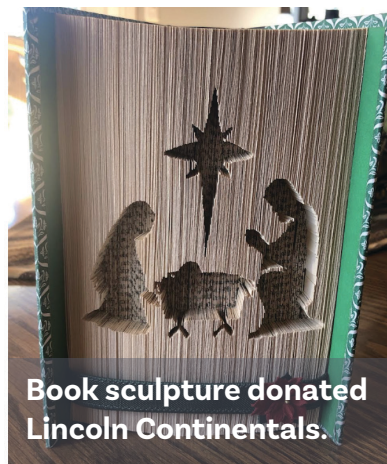
Book sculpture donated Lincoln Continentals.