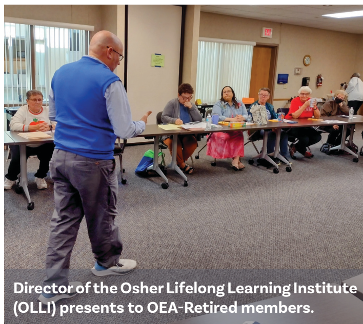
Director of the Osher Lifelong Learning Institute (OLLI) presents to OEA-Retired members.