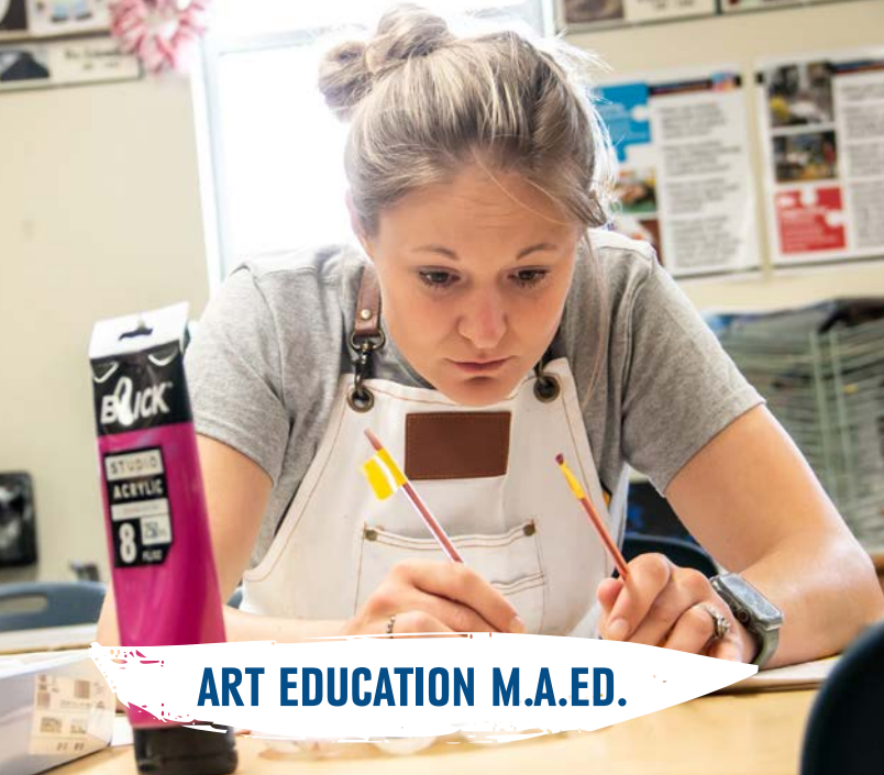
ART EDUCATION M.A.ED.