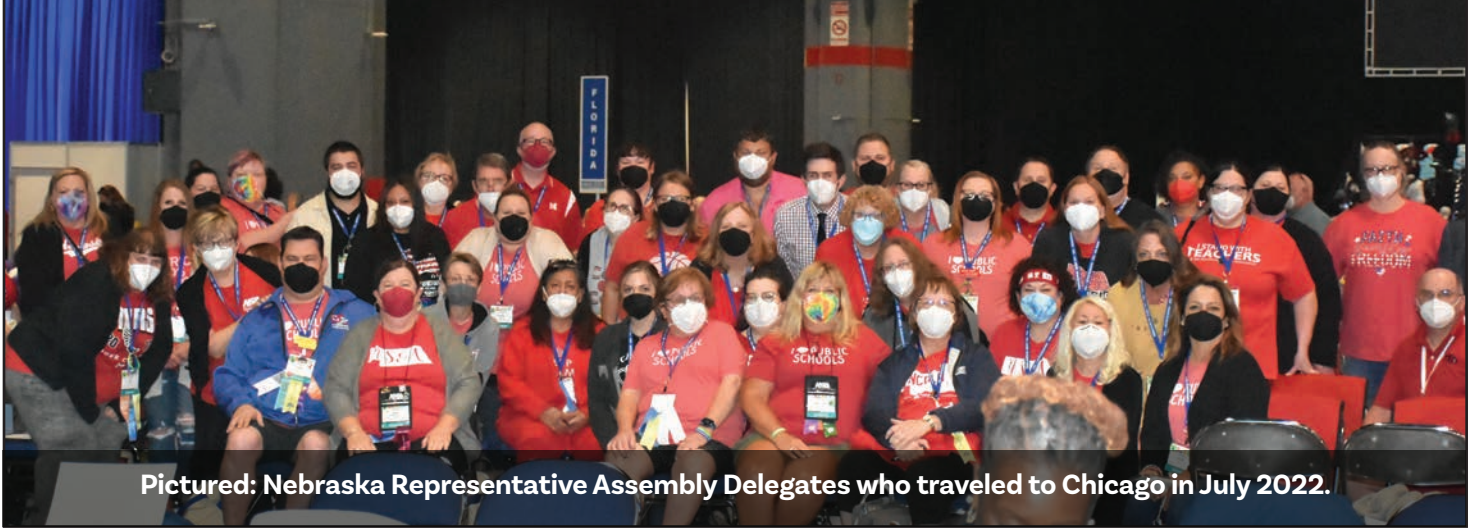
Pictured: Nebraska Representative Assembly Delegates who traveled to Chicago in July 2022.