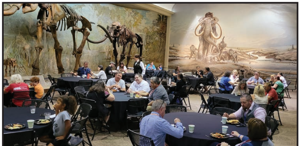
NSEA U attendees and their guests gather in Elephant Hall for dinner at the Dinner, Dinosaurs and Stars event in July.