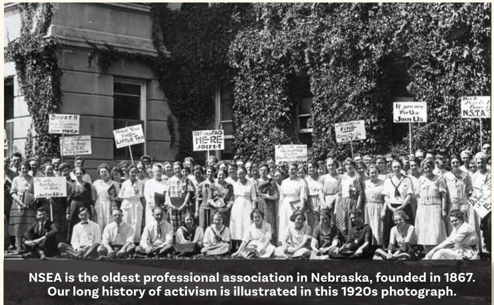
NSEA is the oldest professional association in Nebraska, founded in 1867. Our long history of activism is illustrated in this 1920s photograph.

As a result, exasperated workers are organizing throughout the United States, with successful union efforts