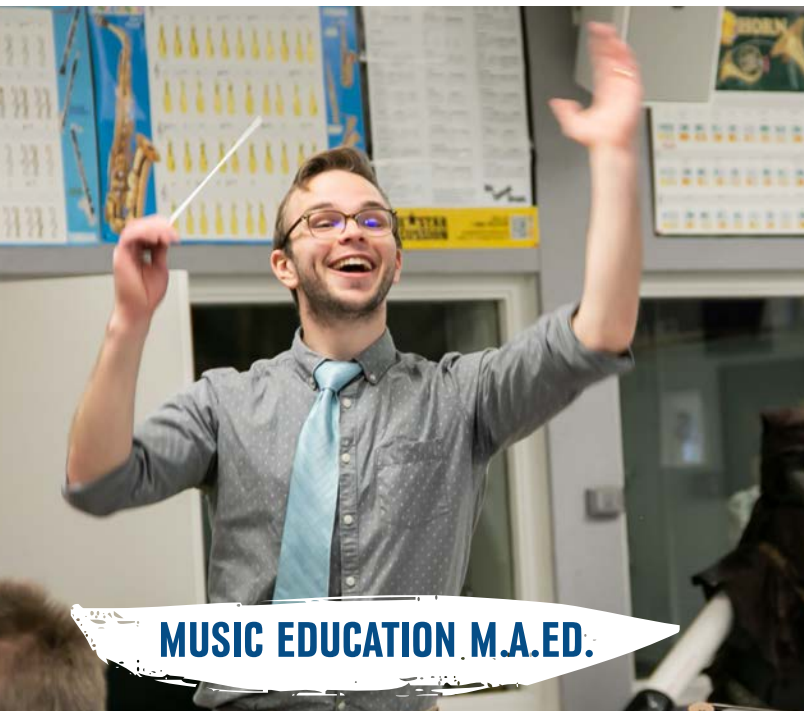
MUSIC EDUCATION M.A.ED.

ONLINE GRADUATE DEGREES DESIGNED FOR TEACHERS LIKE YOU