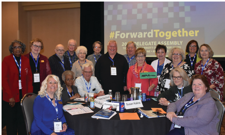
NSEA-Retired delegates attend the 2022 Delegate Assembly held at the Lincoln Marriott Cornhusker Hotel in April.