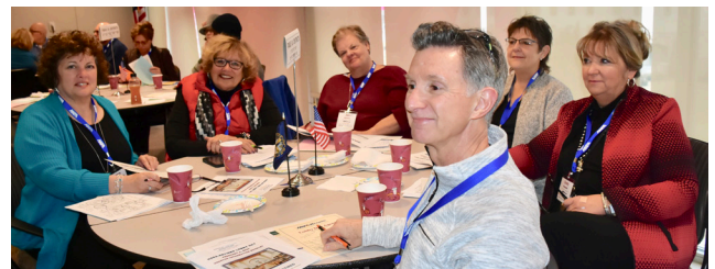
Participants get talking points at 2019 NSEA-Retired Lobby Day